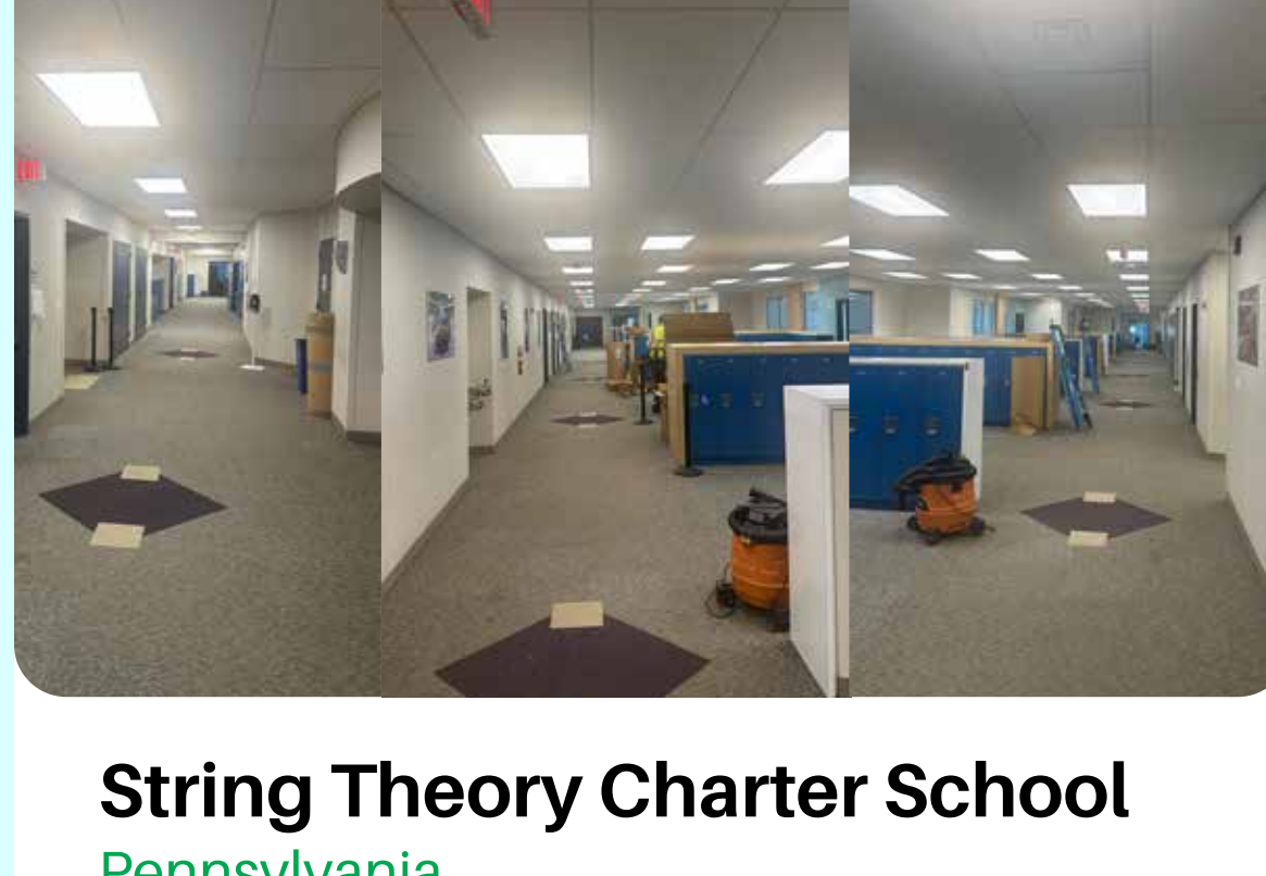
String Theory Charter School Pennsylvania