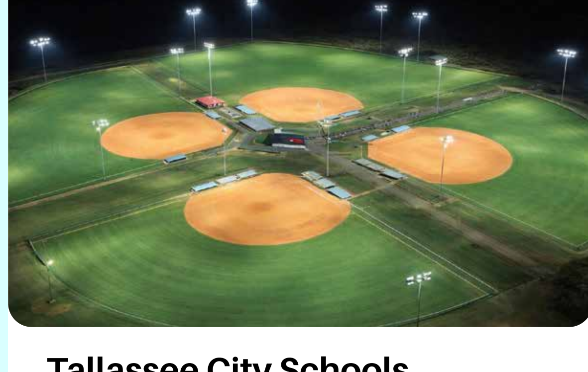
Tallassee City Schools Alabama