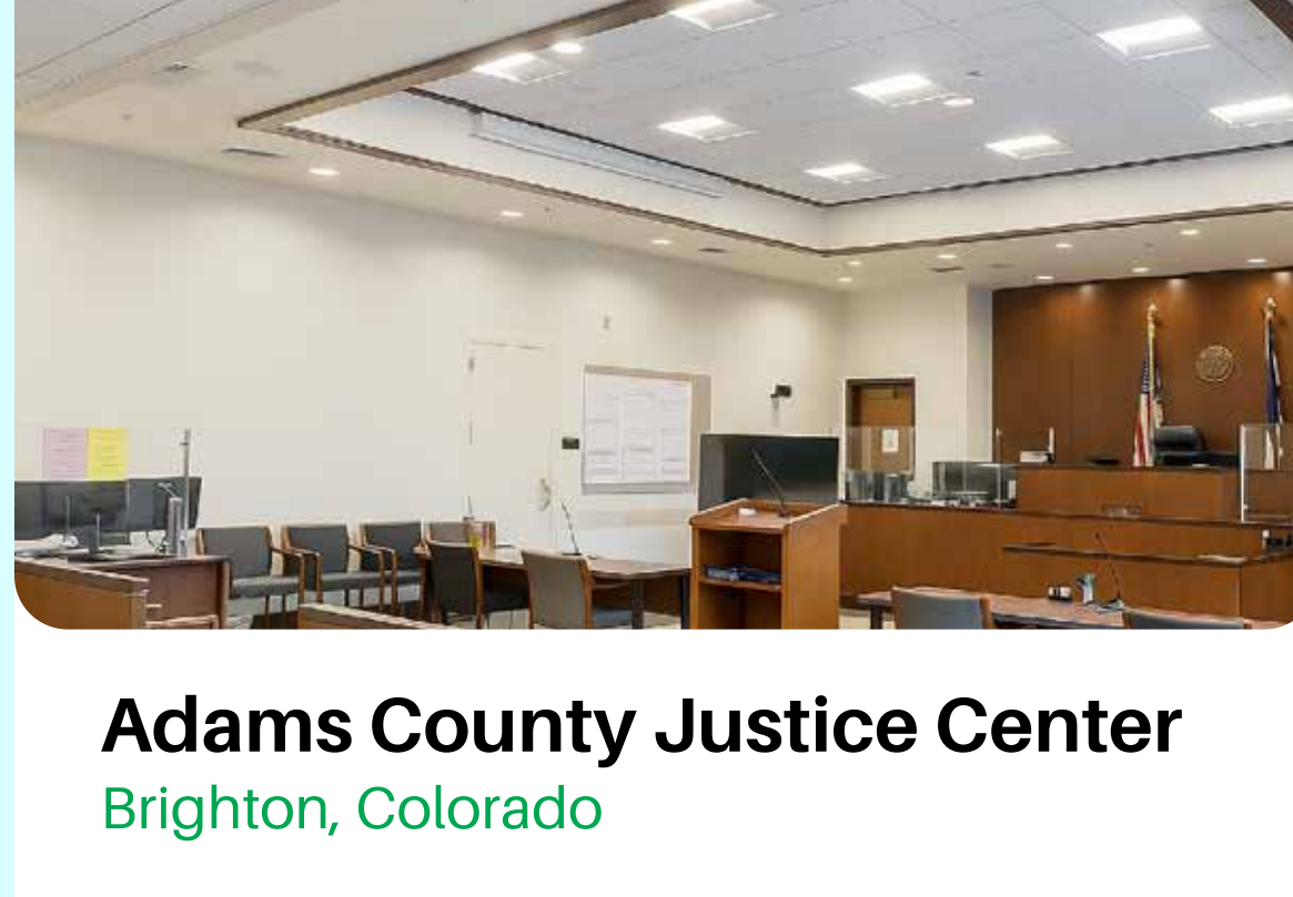
Adams County Justice Center Brighton, Colorado