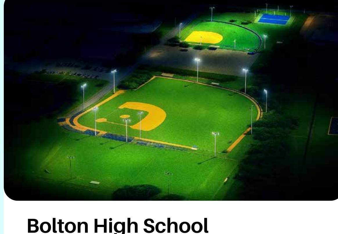
Bolton High School Arlington, Tennessee