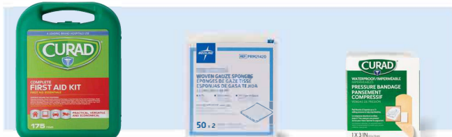
CURAD® 175-Piece Complete First Aid Kit

Treat minor injuries quickly and confidently