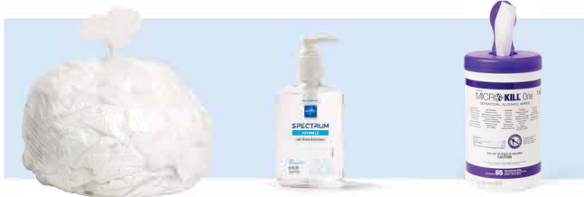
Trash Can Liners

From hand hygiene to cleaning and disinfecting